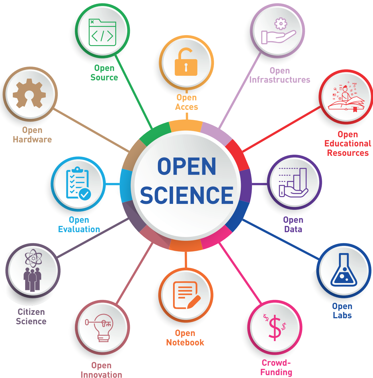
Components of Open Science